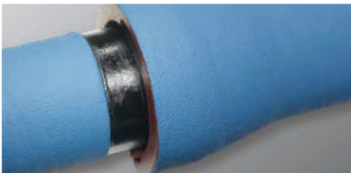
ZMU pipe with a BLS®/VRS®-T joint