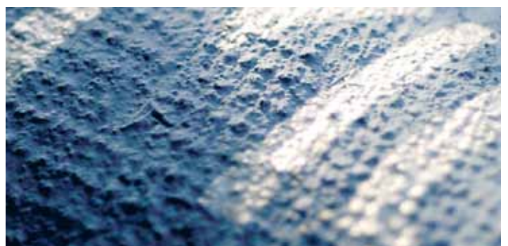
Close-up of a ZMU coating