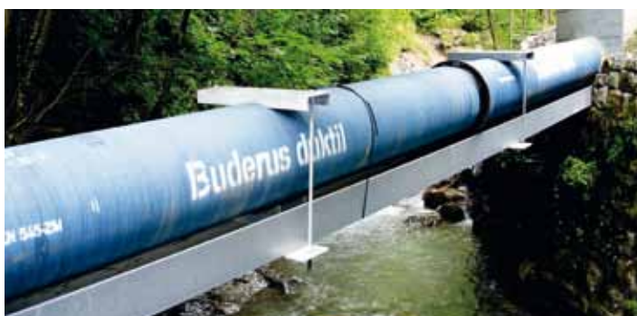
A pipe bridge