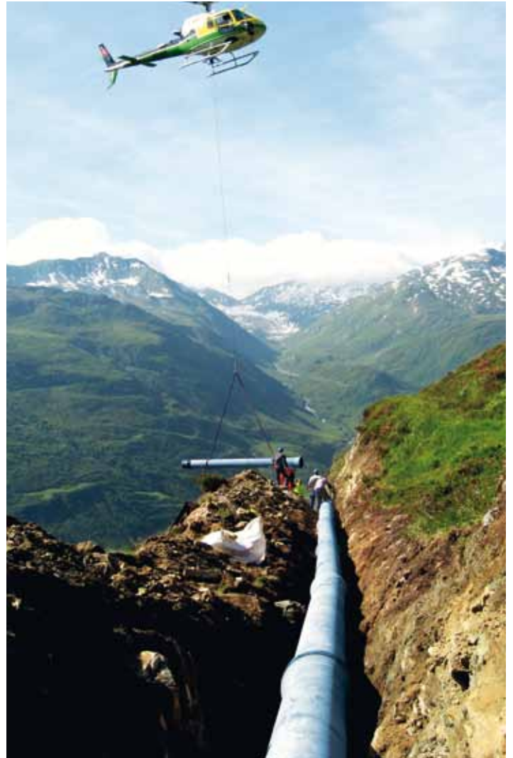
A turbine pipeline