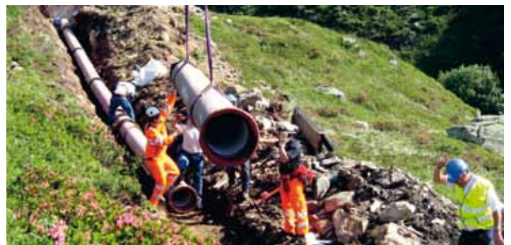
Laying in Alpine terrain